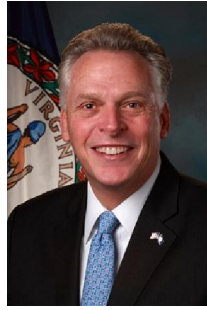
Governor Terry McAuliffe