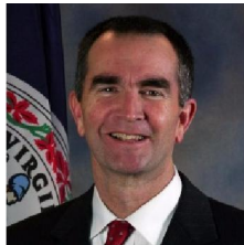
Lt. Governor Ralph Northam (Invited)